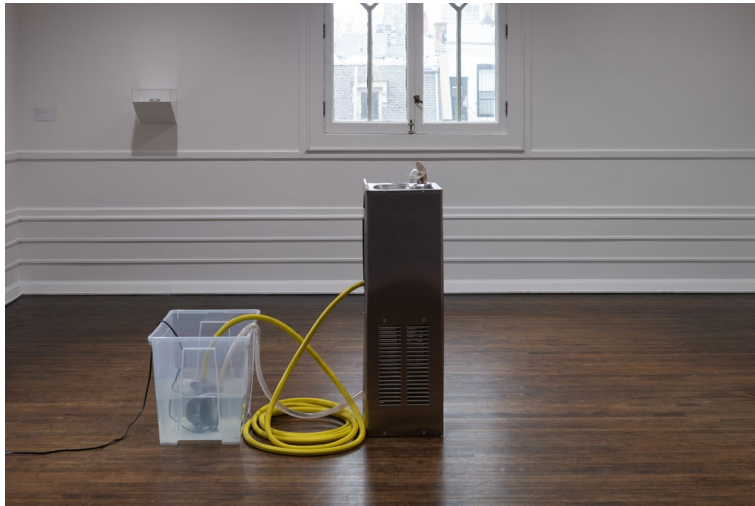
Fontaine Publique Meurtrière (Murderous Public Drinking Fountain, Continental Edition), 2018

Gutted stainless-steel public drinking fountain, chlorine (Cl 2 ), open faucet, recirculating water pumped from plastic IKEA storage box, pump, power, exposed closed circuit plumbing: rubber input tube, plastic discharge tube