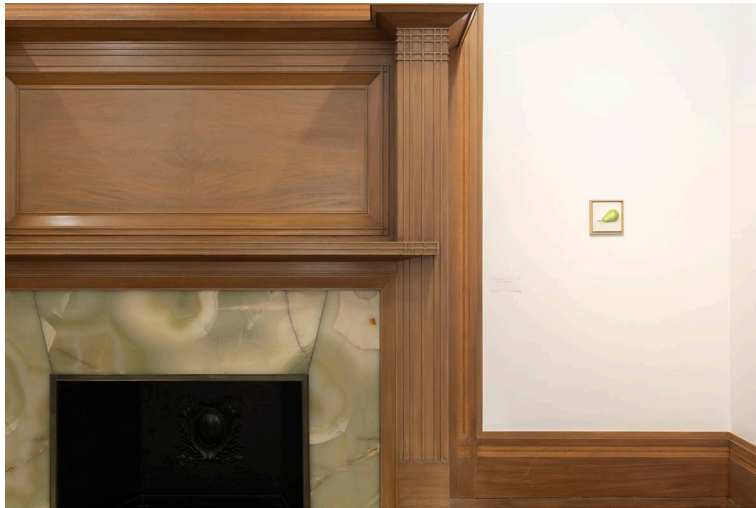
Fainted Pear , 2022 [4]