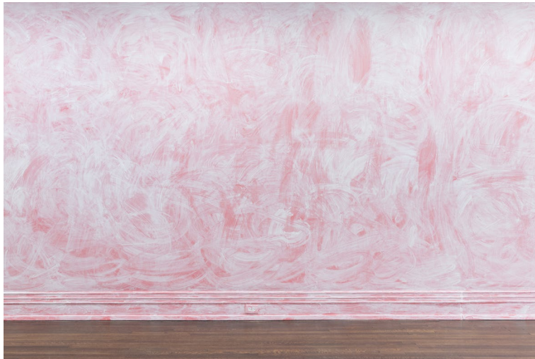
Screen Test for the Psoas Muscle, 2023

Existing internal walls, CSP-1180 semi-gloss paint, white emulsion paint, water, applied with horizontal, vertical, and circular movement