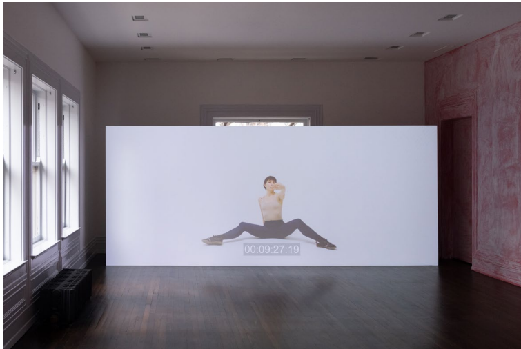
DEAD TIME (Maggie's Solo) , 2021 [continued...]

Single-channel digital projection, colour, single-take 4K Steadicam recording, adjacent room for soundtrack, Fohhn Scale-2 loudspeaker, Fohhn MA-4.100 amplifier, projector, wall bracket, digital countdown