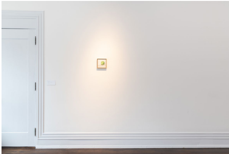
Fainted Pear , 2022 [2]